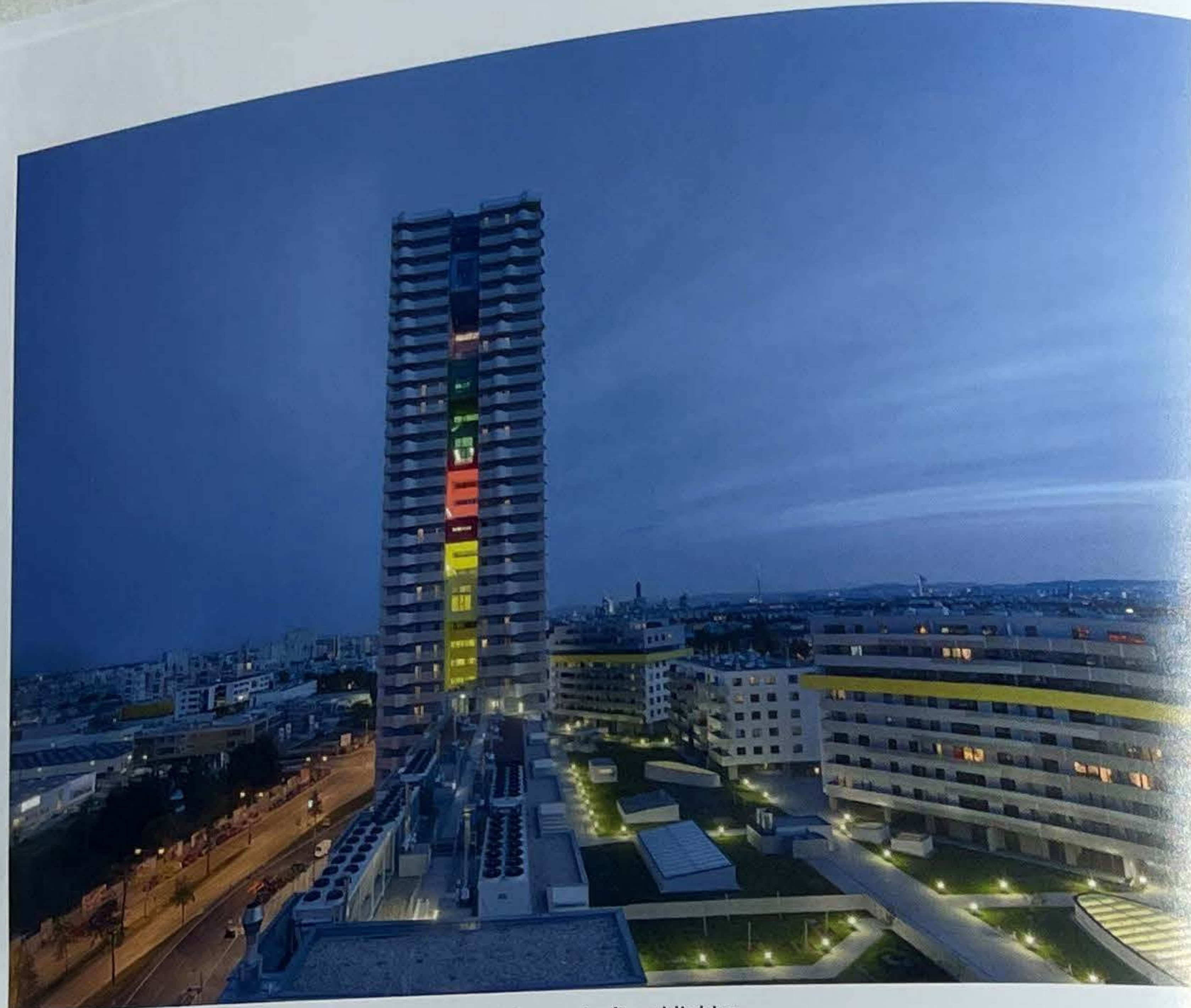
10. CGLA-city gate tower residential highrise vienna (c)lukas dostal - querkraft architektur