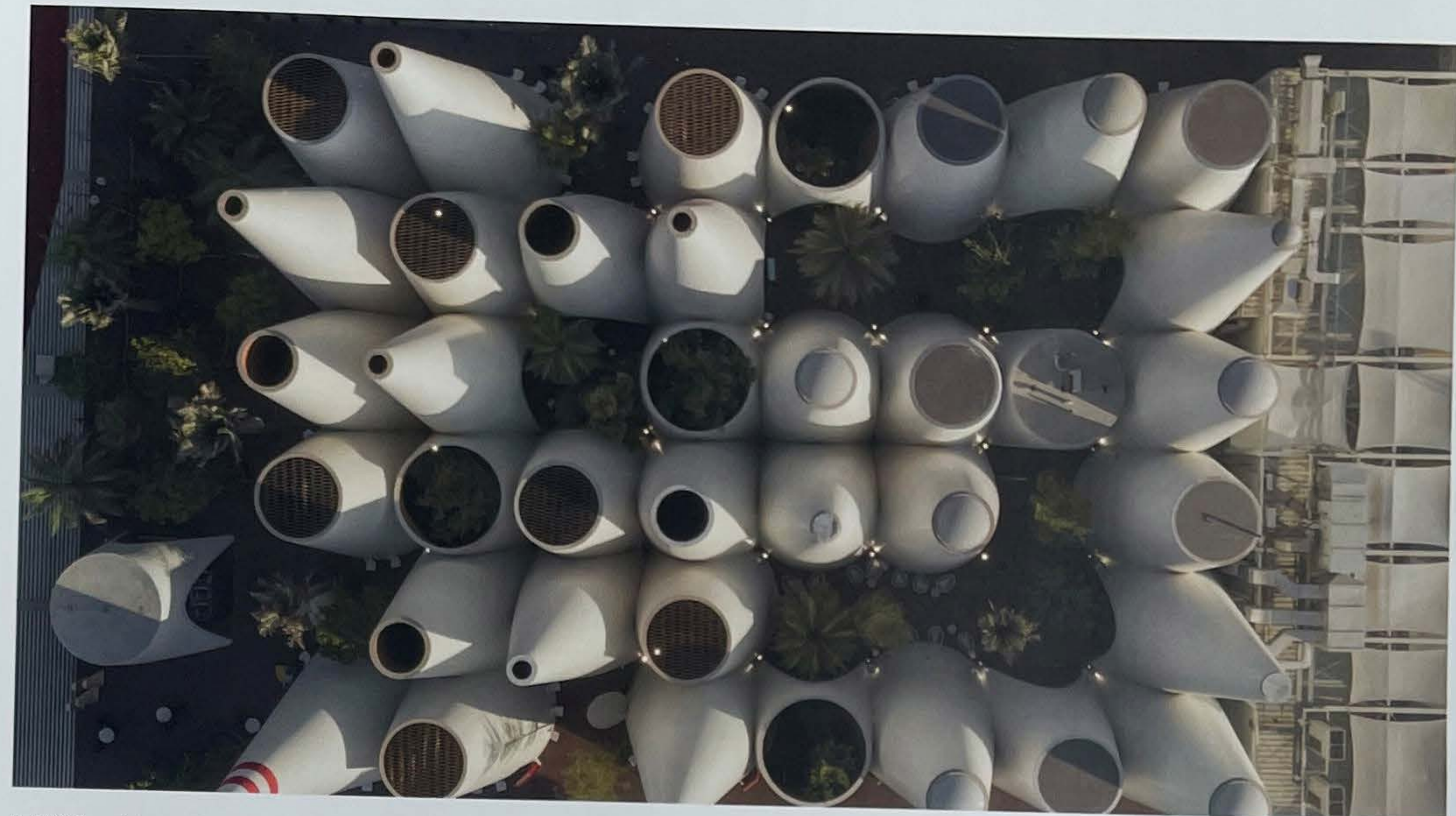
2. EXPO-austrian pavilion dubai 2020-(c)dany eid - querkraft architektur

The building projects out on two sides over steep-sided ground, high up in the landscape.