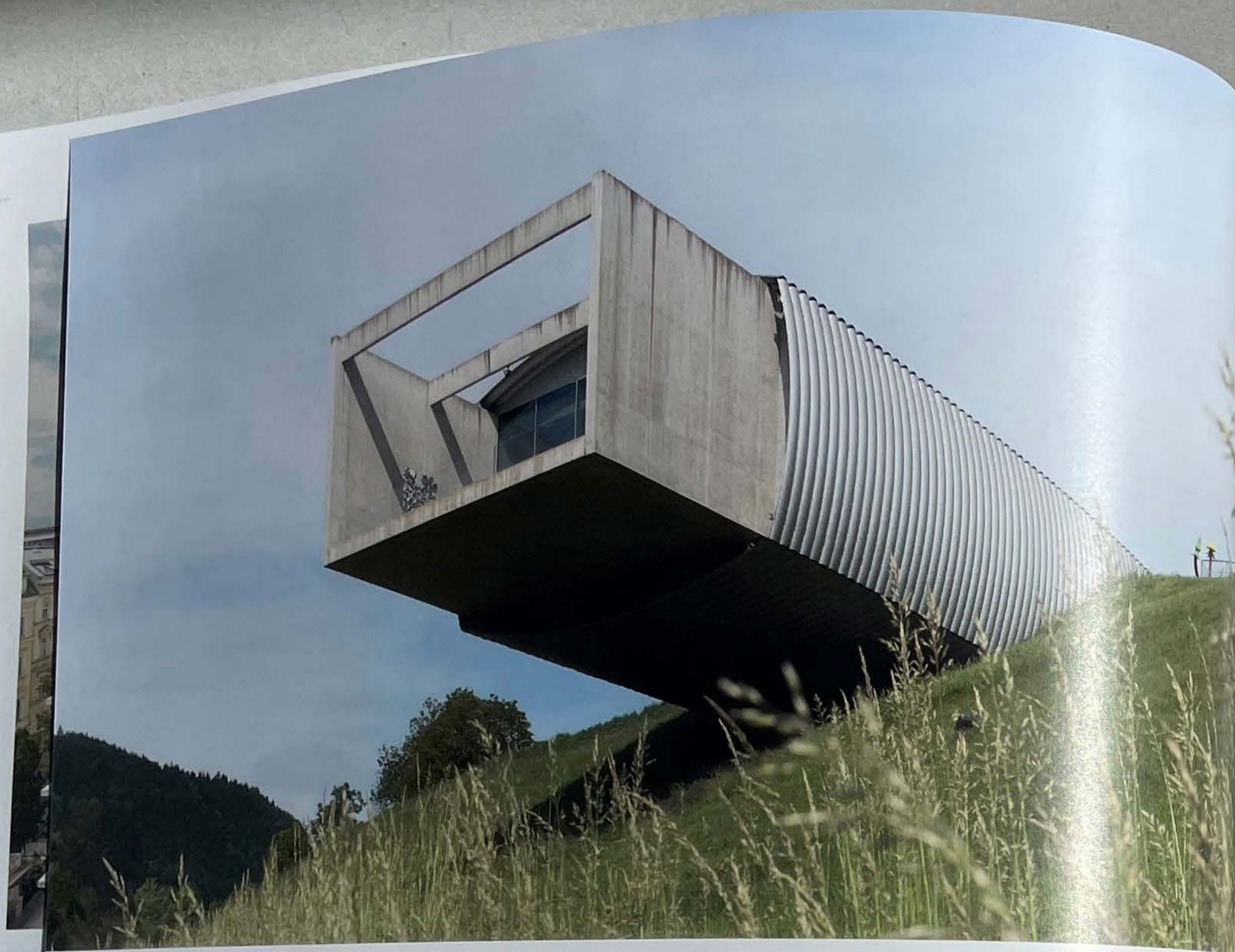
1. IKEA 3. ML-museum Ilaunig (c)Isa rastl - querkraft architektur