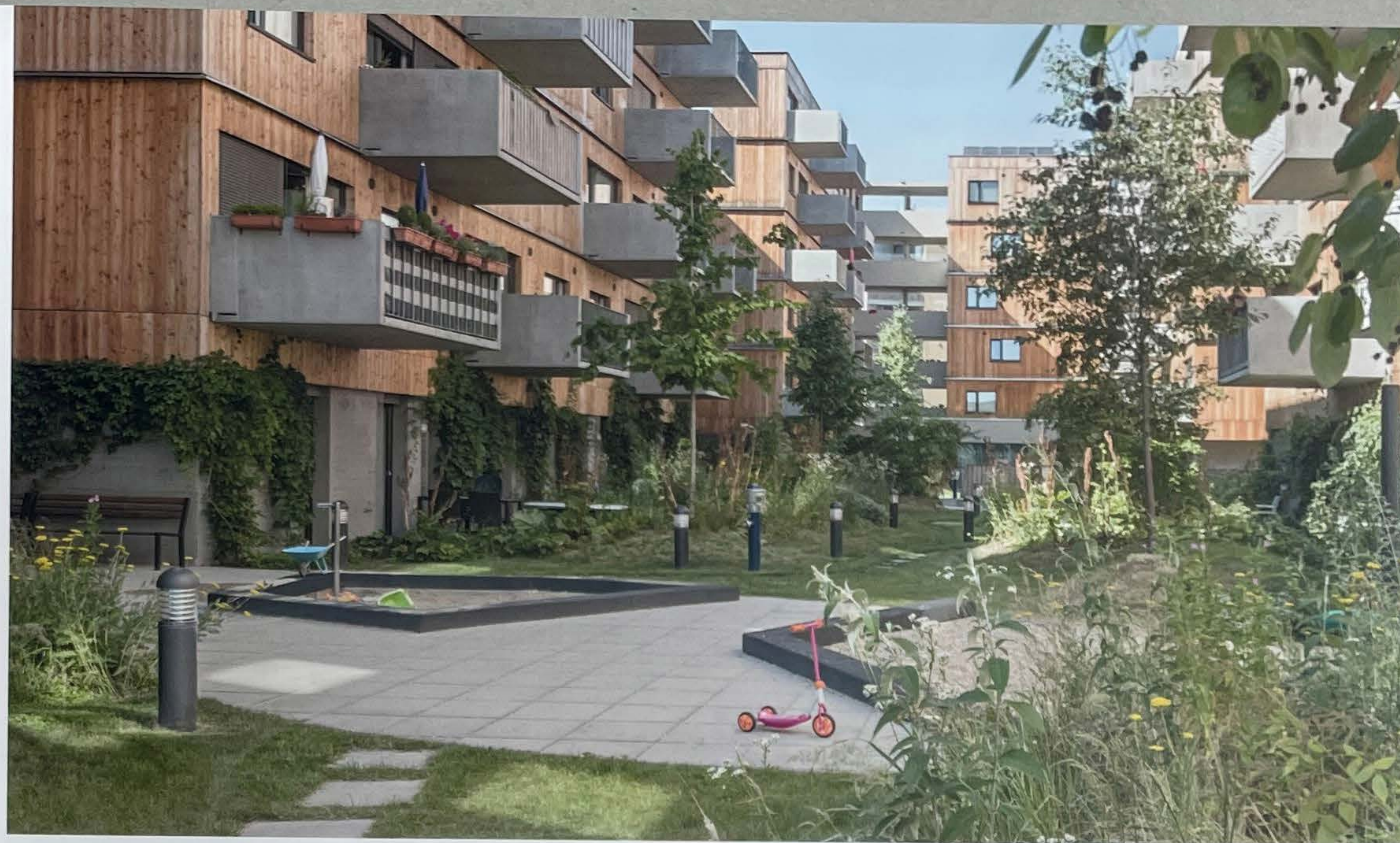
5. ASP residential complex aspern (c)hertha hurnaus-querkraft architektur

A void extending right through the interior of the building allows visual contacts between the different stories.