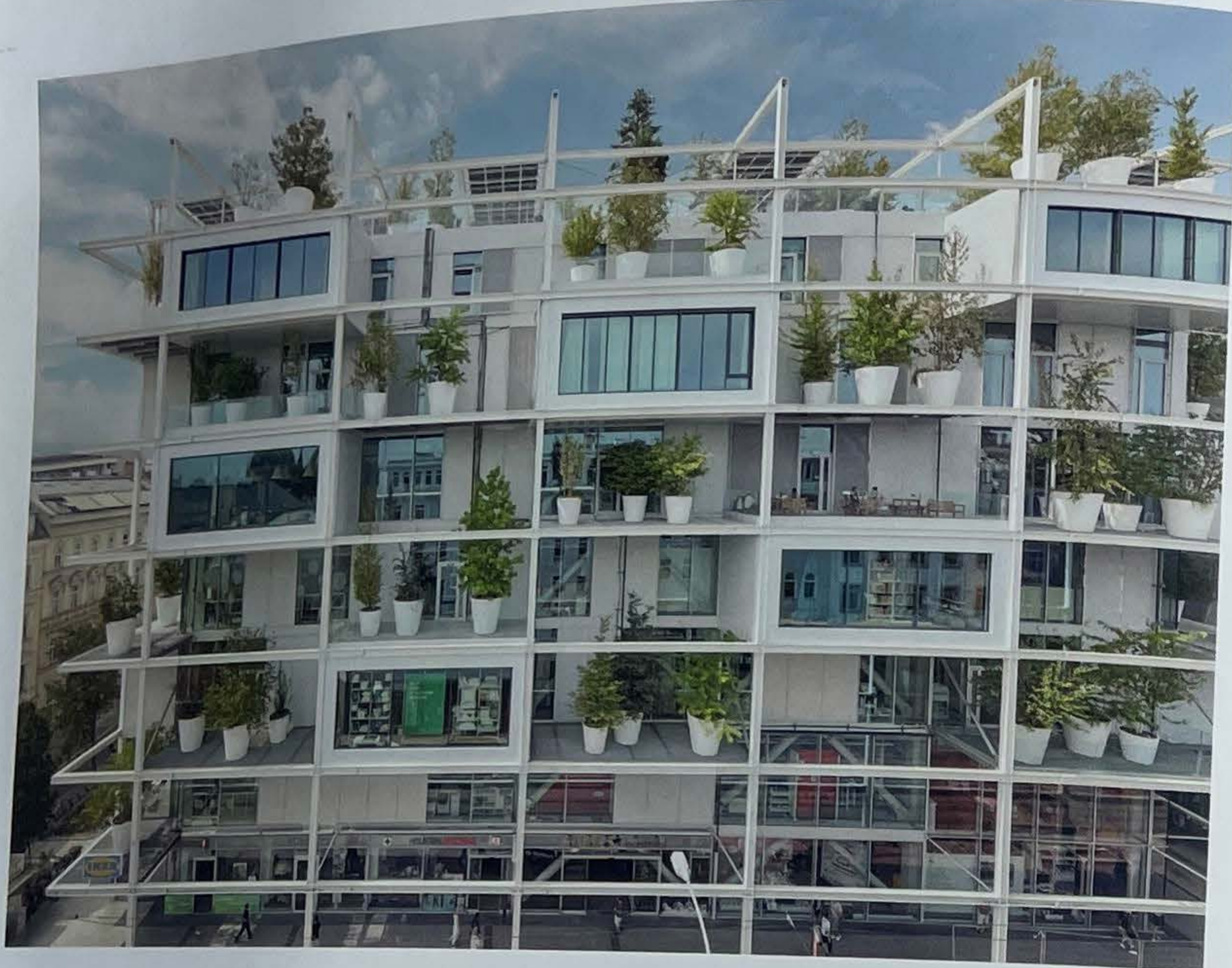
1. IKEA-wien westbahnhof- - querkraft architektur