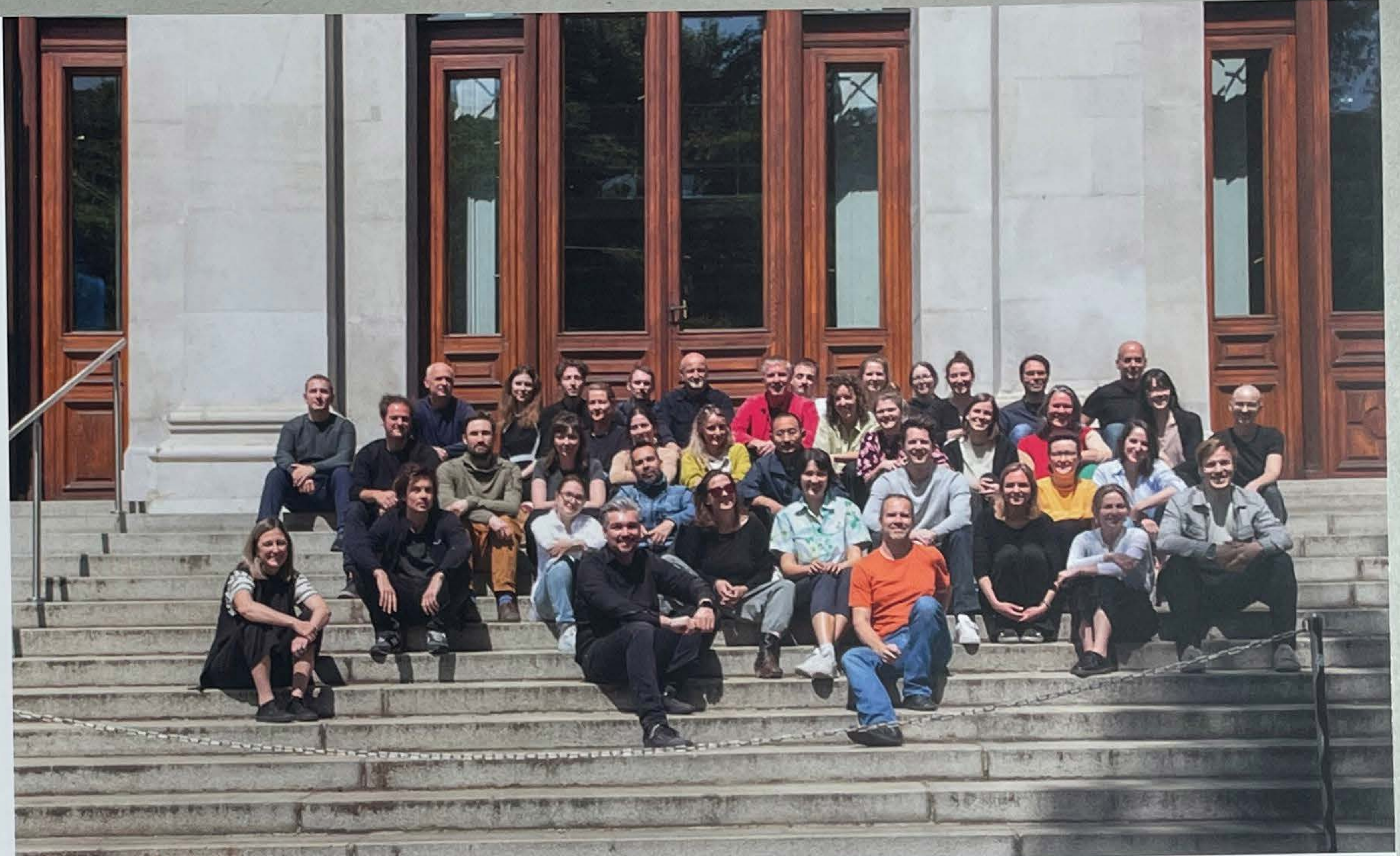
12. The 2023 querkraft architektur team.

project to a point when it can't be optimized any further, they never forget about the emotional component of the architecture they deliver.