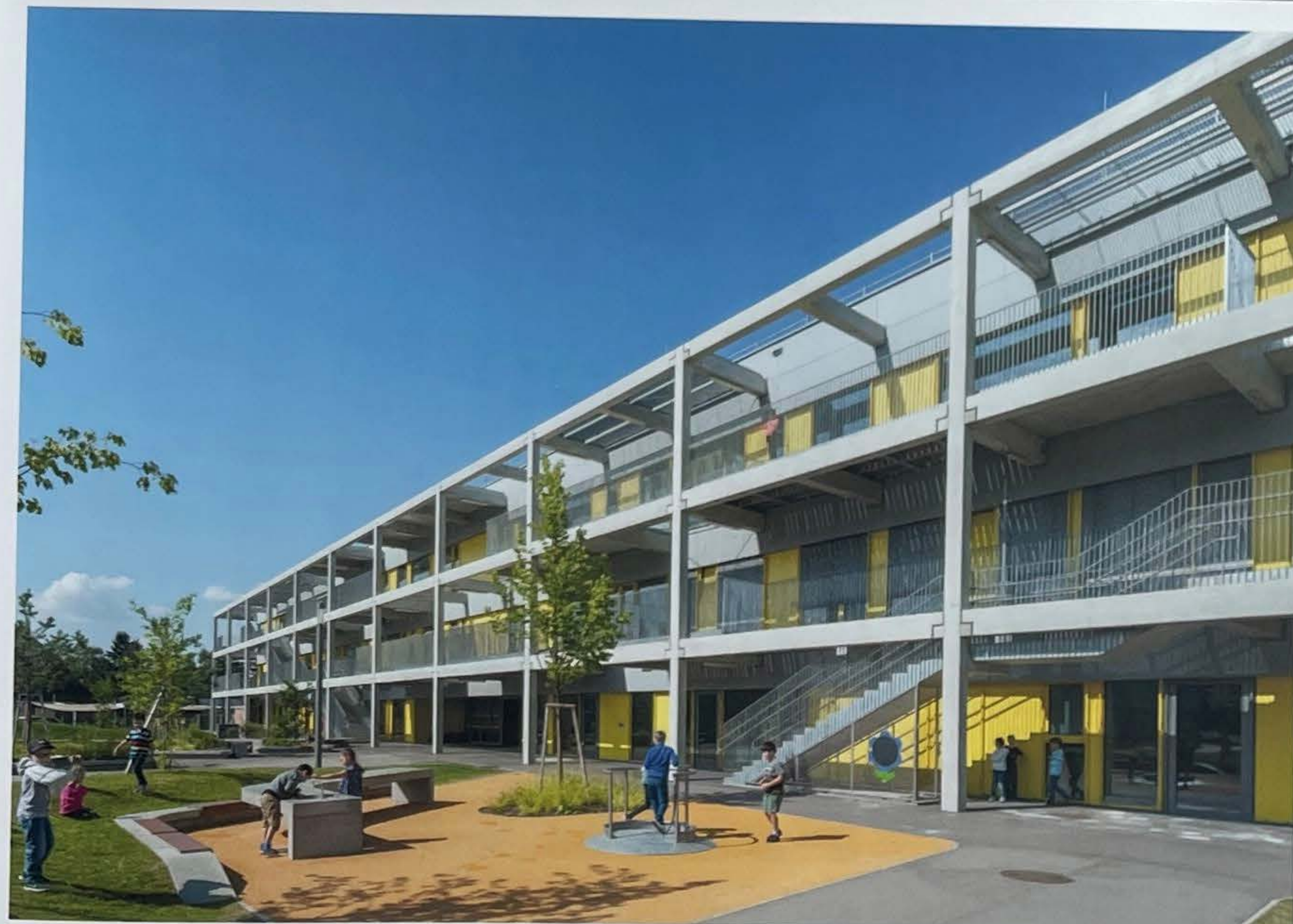
8. ATT-bildungscampus attemsgasse wien ©lukas schaller - querkraft architektur