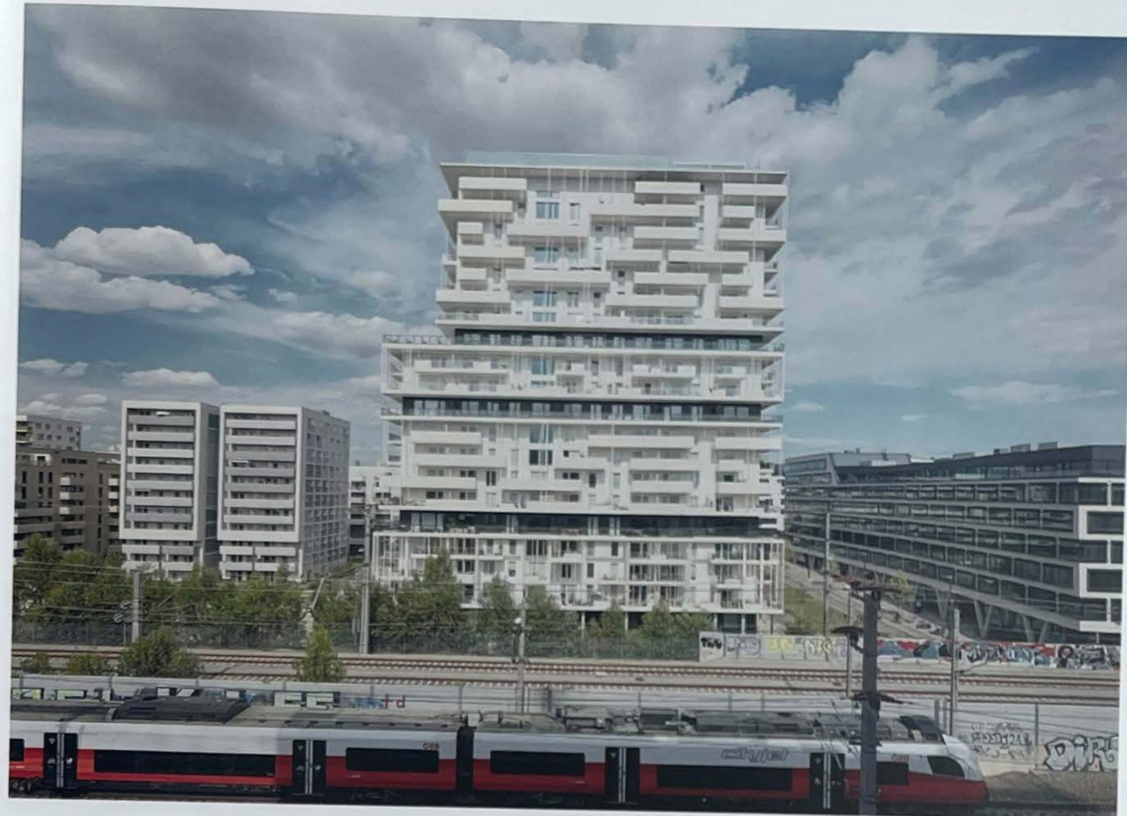
7. TABORAMA residential highrise ©christina haeusler - querkraft architektur

While looking for the most transparent, uncomplicated solution, optimizing each