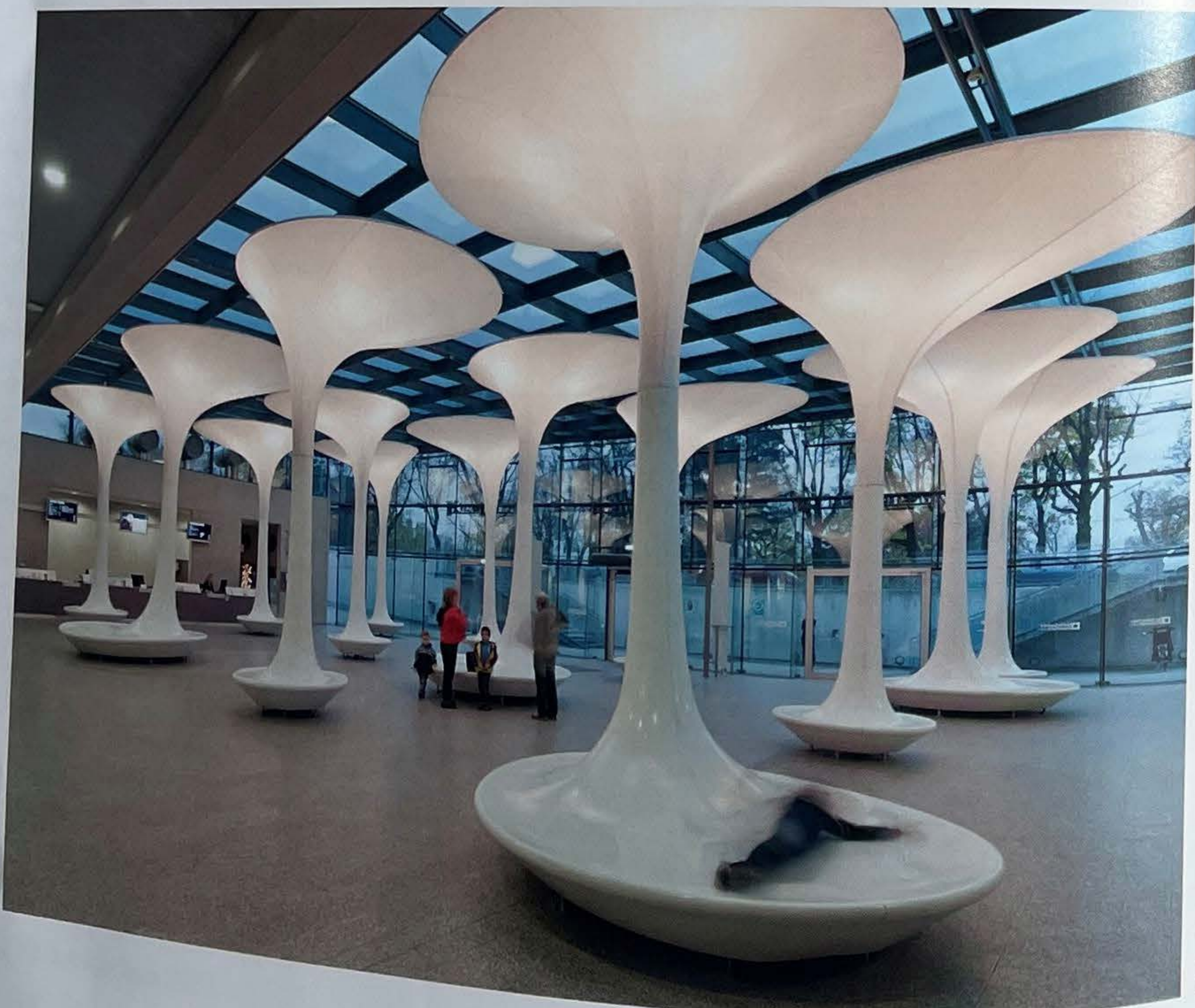
4. TMW-technisches museum wien (c)Isa rastl - querkraft architektur